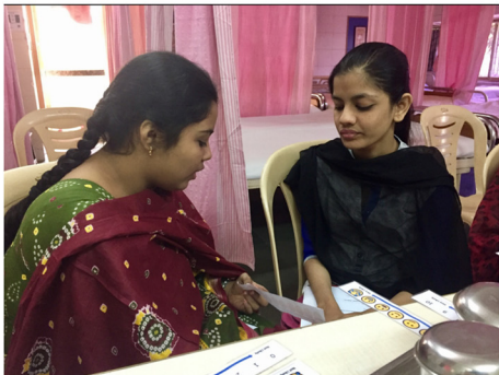
FIGURE 2. Two Net Promoter Score Implementation Approaches Tested in India