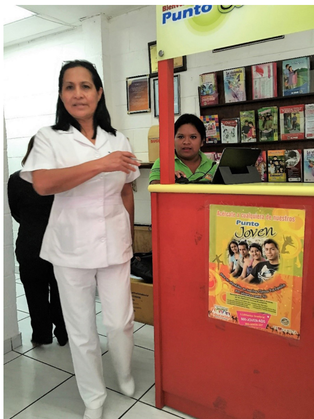
In El Salvador, a clinic supervisor and youth peer promoter tend a kiosk where the Net Promoter Score survey is set up for clients to provide feedback.